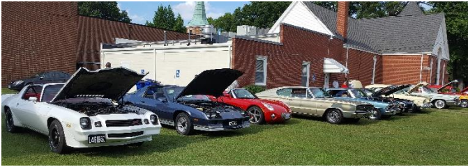
Some of our many cars on exhibit

Joins us for our next event on September 11