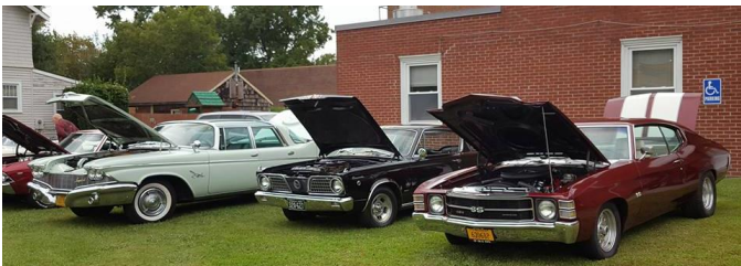
Some of our many cars on exhibit