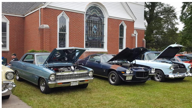
Some of our many cars on exhibit

Joins us for our next event on October 9