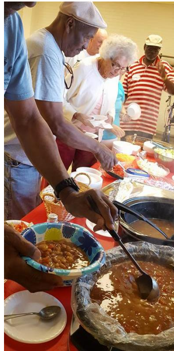
Ham & Bean Soup