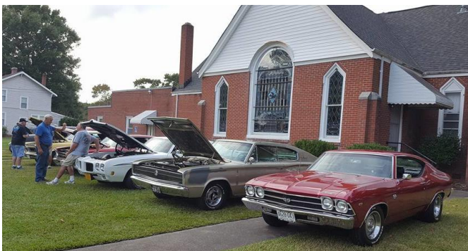
Some of our many cars on exhibit